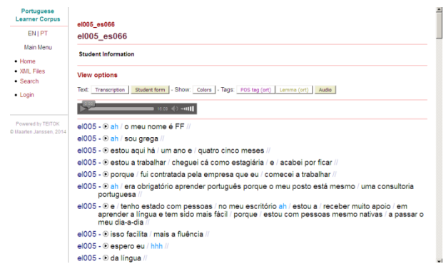
Figure 4: Visualization of a recording transcription.

Regarding the spoken transcriptions, EXMARaL-DA files were converted into TEI format. The spoken transcriptions are visualized as speech turns with a link to the audio sequence (cf. Figure 4).