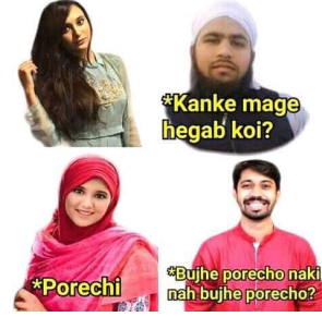
Figure 1: Category - Hateful, Context: Religion

The exponential growth of social media platforms such as Facebook, TikTok, Reddit, and Instagram has paralleled the expansion of the internet, transforming them into powerful tools for expressing opinions on politics, business, entertainment, and current events (Oldenbourg, 2024). However,