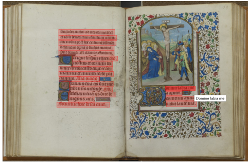
(a) Line detection (in red) and automated HTR (in tooltip "Domine labia me")