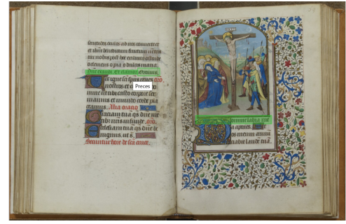
(b) Manual annotation (in green) of sections (in tooltip "Preces")